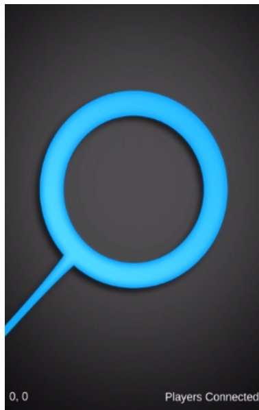
Fig. 2. Screenshot of the interface of Remote Touch .

Once two users connect to the application, the latitude and longitude is sent from one user to another by GPS. This allows the interface to point in the direction of the remote user by calculating the difference between the two sets of coordinates and then further calculating the angle between these differences. As User A tugs on their interface, the tugging action from User A is reciprocated to User B, in the form of an inverse tugging action toward the origin of User A. Along with the interface notification, haptic feedback allows the user to become aware that a remote user is “beckoning” them in their general direction.